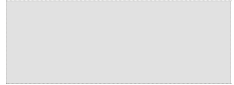
TIMBRO / CUSTOMER'S SEAL / TAMPON

MODELLO 12 GRADI : DG-PBF MODEL / MODELE